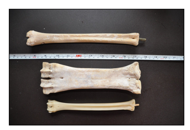
Large deer, cow, small deer.

For two pairs of bones, for the attachment of laces, I drilled one hole laterally through the front and another longitudinally at the rear, then added a wooden peg. (The tool used was a cordless power drill because I lack access to and expertise in making and using a period bow drill.)