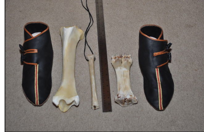
The three types of bones used (from left to right): horse, deer, cow.