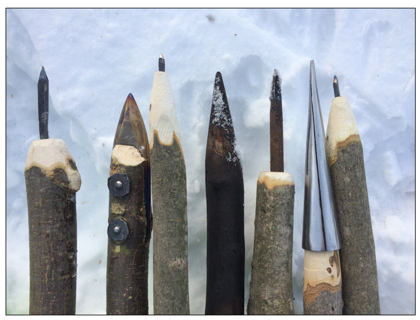
The complete set of seven pole tips. From left to right: large nail, custom mounted blade, medium nail, fire-hardened wood, hardened metal spike, spear butt cap, small nail.