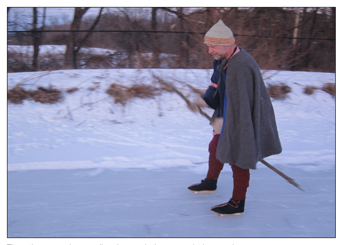
The author on cow bones poling along, as in the manuscript images above.

It should be noted that using the poles resulted in many spots of chipped-out ice, thus destroying the smooth surface needed by the bone skates. It seems that too much poling in one area would roughen it quickly and ruin it for other skaters.