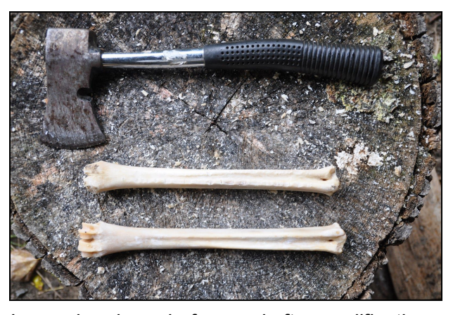
Large deer bone before and after modification.