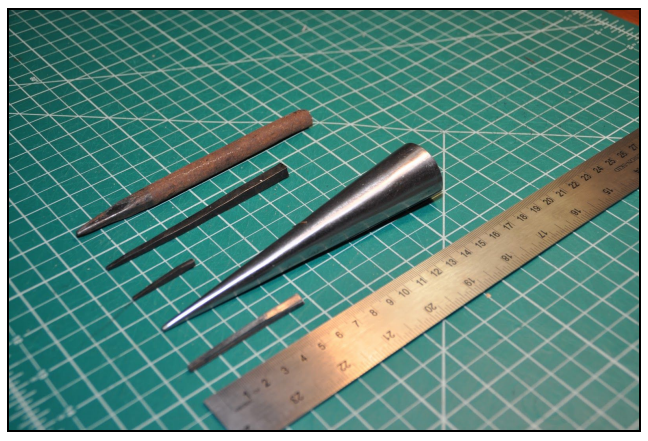
Spike and nails before and after beheading, along with the spear butt cap.