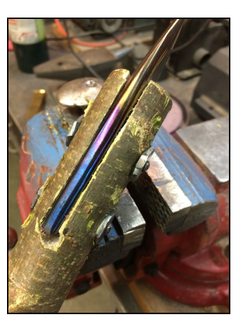
Crafting the custom blade: cutting from found spring steel; cut, gound, polished, and drilled ready to mount; mounting in progress; successfully mounted.