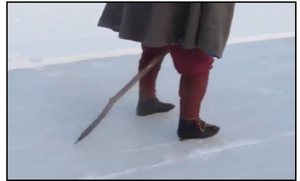
Video stills showing trials with cow, horse, and deer bones (left to right).

All of these factors will be felt differently by people with different sizes of feet and body weights, and perhaps different senses of agility or control. It's certainly possible that adults, youth, and children preferred different types of bones based on their shoe size and experience with skates.