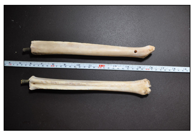
The deer bones before and after shaping, drilling, and roughening. The cow and horse bones were also shaped with the hatchet to flatten them, angle their front ends, and add texture to their top surfaces.