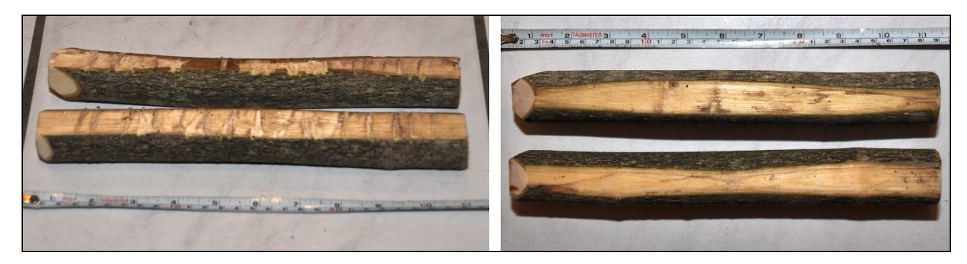
Wooden skates. Left: roughened top surface, Right: planed bottom surface.